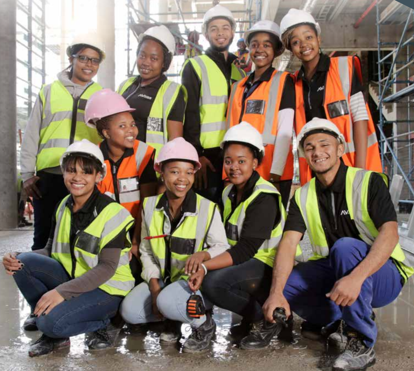
Engineering students working on the CTICC East construction site